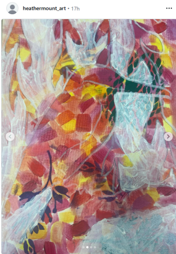
heathermount_art Elm class are producing a fantastic set of bird paintings. After decorating a canvas using paint and stencils, they are... more

We are excited to announce that you can now view artworks completed by our students on Instagram. Heathermount_art will be regularly updated with examples of their work. Do follow the page! It's a brilliant way to learn more about art at Heathermount and see examples of students' creations. NB No student names or photos will be included on the site.