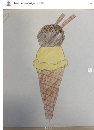
heathermount_art After studying the work of Claes Oldenburg, Mercury are designing their own icecream which they will make into a 3D... more