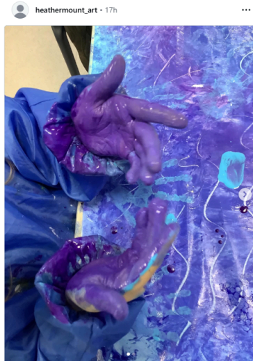
heathermount_art Cherry class had a lot of messy fun today using paint and objects, including their hands, to make different marks. These... more